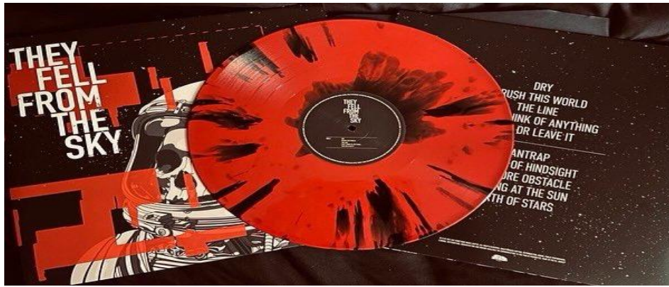
Figure 1. DECADE album cover image on a vinyl record