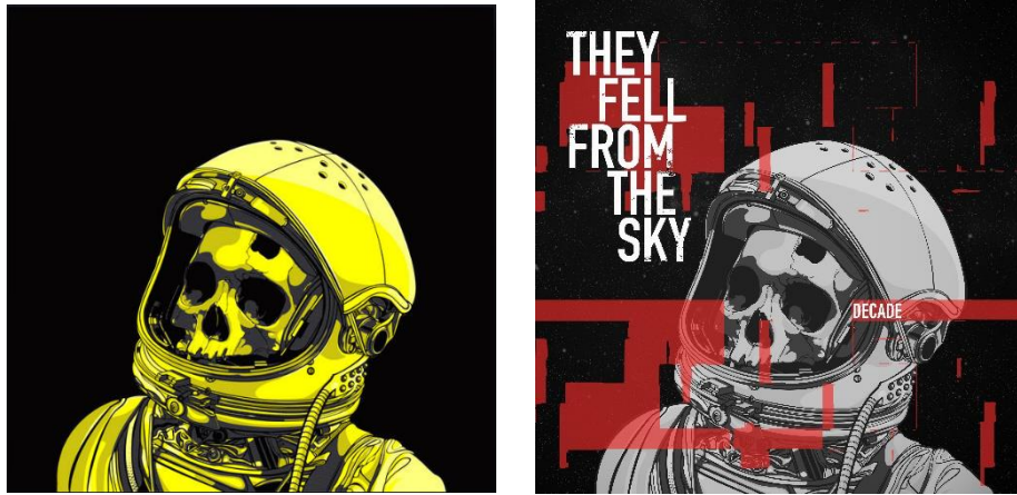
Figure 2. Artwork titled "Binasa" (Indonesian) or "Perish" (English) (left) and "DECADE vinyl record album cover" (right)