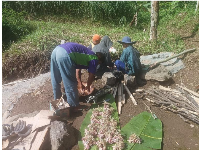
Figure 4. Cooking the goat