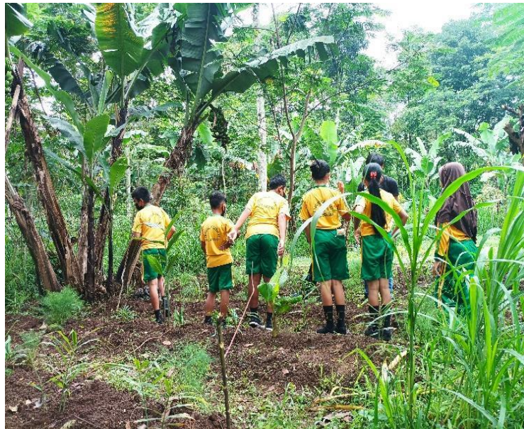
Figure 3. Familiarizing the village landscape

The myths are also present in village landscapes. In addition to marking territorial boundaries, this knowledge of the village landscape is present when paying taxes or when among fellow farmer-dancers referring activities in the fields as work in the office. For the Tanon villager, the landslides of Ngrawan and the displacement of the Ngrawan villager in the past made their village narrow and no longer had the bengkok . However, the tax letter C of the Ngrawan hamlet still mentions the ownership of Tanon's land. Meanwhile, for Padhan villager, the village landscapes is embedded in their daily lives to remind the Ngrawan people not to reach for their rempela or gizzards since they gave their hearts to the Ngrawan people in the past. This is in accordance with the Javanese proverb, " wis diwenehi ati, aja ngrogoh rempela ".