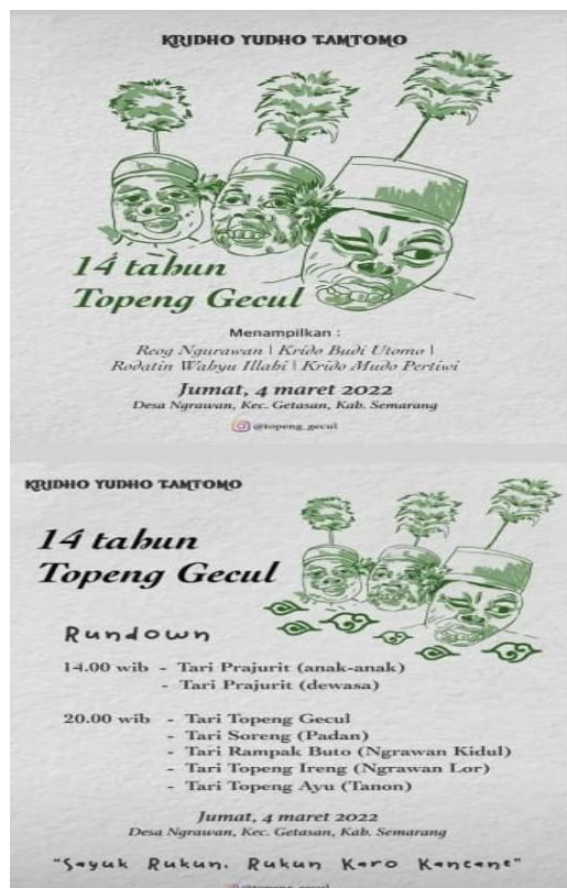
Figure 1. Celebrating Isra Miraj in Ngrawan village