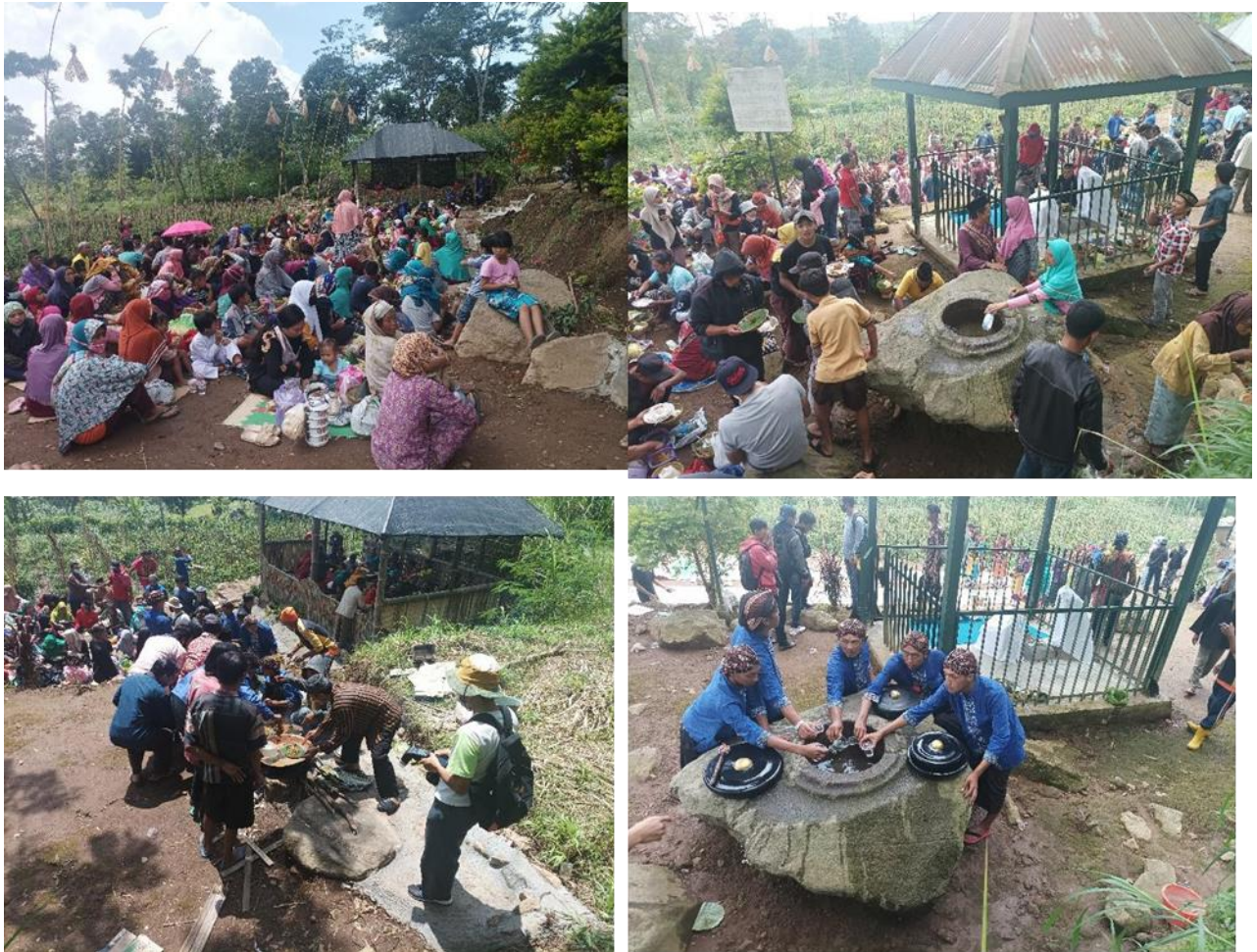
Figure 5. Rejeban in Ngrawan Inscription Site